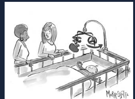
“ALEXA PICKED IT OUT.”