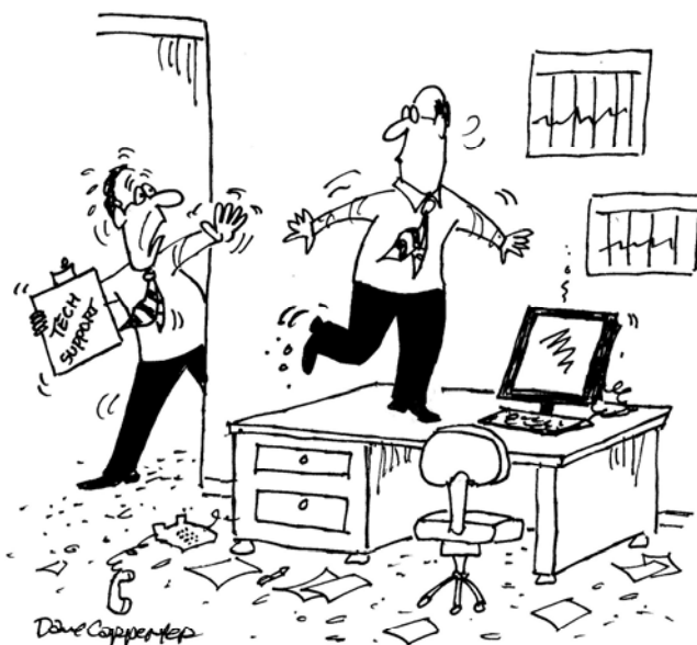
"Hold it! That's not what they mean by 'reboot'."

Make sure you're not overworking yourself on a regular basis. Stick to a schedule that gives you plenty of time to complete your work while also leaving time for other activities outside of the workplace. Your business will survive without you dedicating 80 hours a week to it. When you do get free time, participate in your favorite activities, exercise regularly and spend plenty of time outdoors. Don't be afraid to schedule time on your calendar for personal reasons so that you can take time away from work. Schedule your nightly meals with your family or a weekly round of golf with a good friend. Making these changes will help you feel like you're getting your life back while still maintaining a profitable business. Remember that you have to make these changes - they will not occur on their own or without any effort on your part.