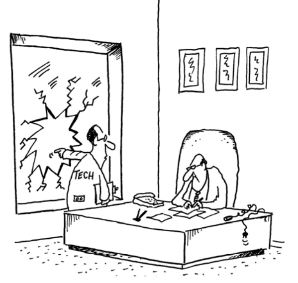
"Is that computer, down there, the one you were having problems with?"

It's important to stay up-to-date on all the new methods used by cybercriminals in order to keep your business protected.