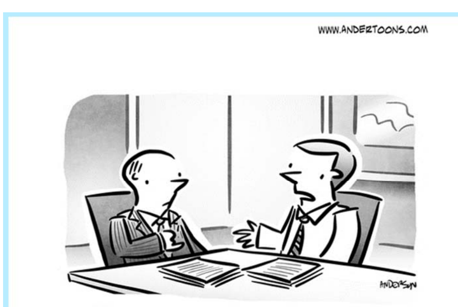
"The contract is signed, so a pinky swear seems like overkill, but if you insist."

There is no delete button on the Internet. Everyone knows how to capture a screenshot. Even if you keep your social media completely private, when relationships change, nothing is private. Are you going to be comfortable in 10 years with what you post today? It will be archived forever. If you post in online forums or comment on news -related websites, consider using a